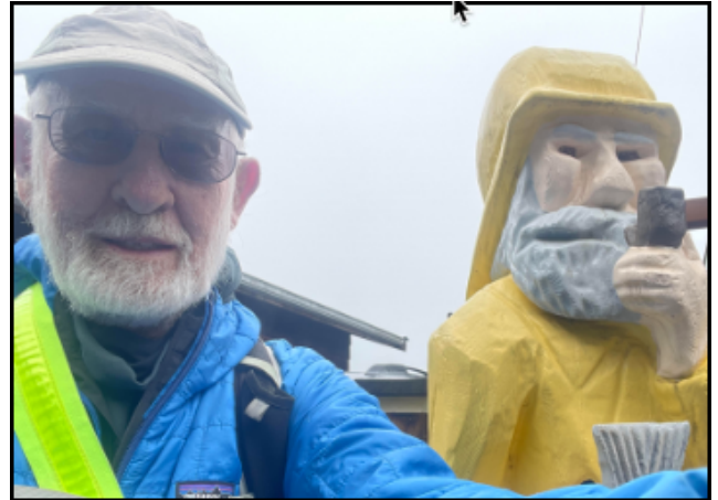
Old men gather here