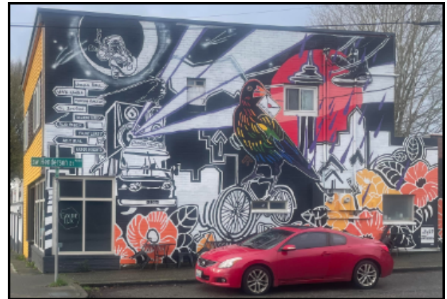
Love Letters to West Seattle

For public transit options, public bathrooms and treats see directions, last page.